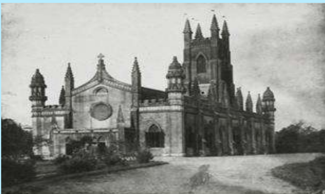
Christ Church, Cawnpore taken on 3rd March 1857 copied from a paper negative found the Cawnpore Bazaar after the Mutiny.